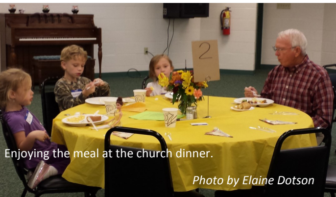
Enjoying the meal at the church dinner.